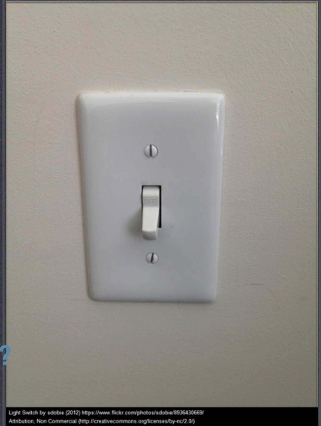
Light Switch