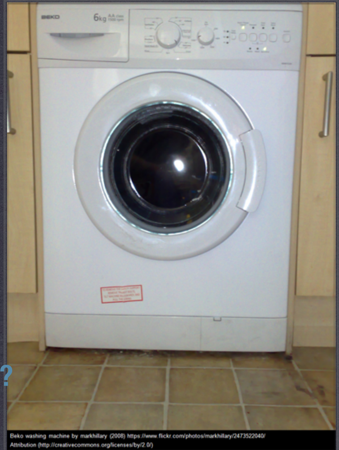
Beko washing machine