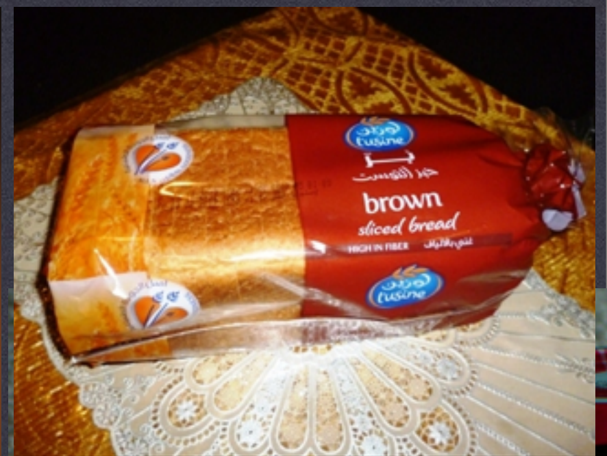
Bread